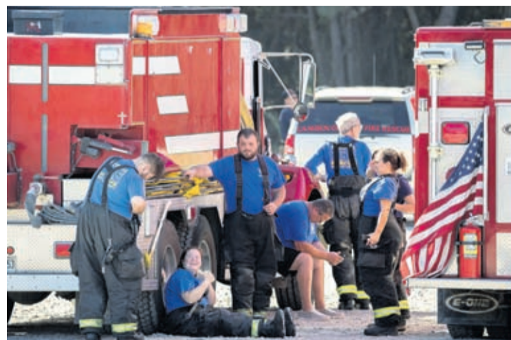
Members with the Waynesville Fire and Rescue Department take a break from battling large fire that burned inside a chemical plant on the coast of Georgia, Monday, Nov. 7, 2022, in Brunswick, Ga.